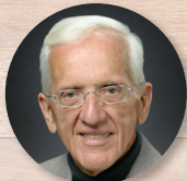
T. Colin Campbell, PhD KEYNOTE SPEAKER A WHOLE New Definition For Nutrition

Learn about the power of a plant-based lifestyle from some of the nation's leading experts.